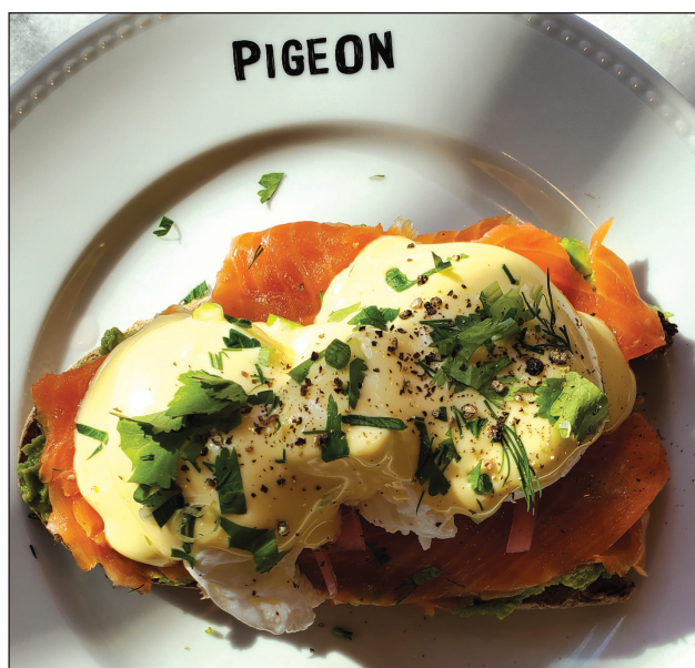
Smoked Salmon Avo Toast

Pigeon Café is located at 5625 Monkland Avenue. The phone number is 514- 484-0062. Log on to pigeonespresso.com . Delivery is available via Door Dash and Skip The Dishes