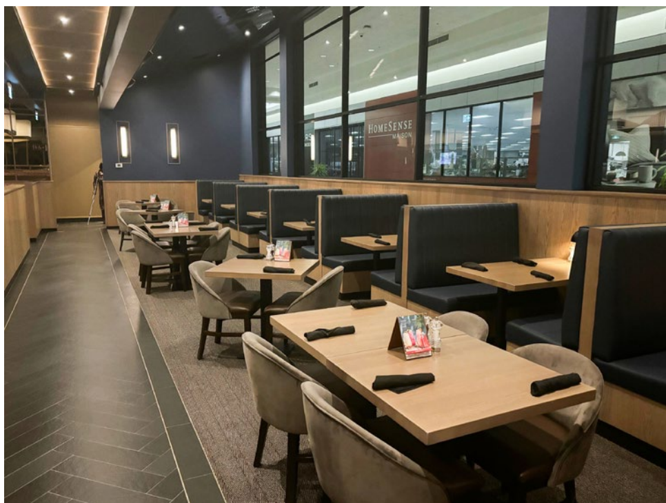
| The dining room at the new location is fully wheelchair accessible.