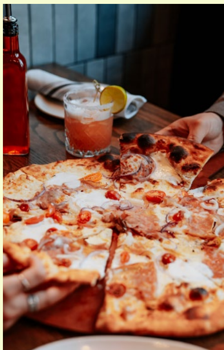
| One of Monza's delicious pizzas.