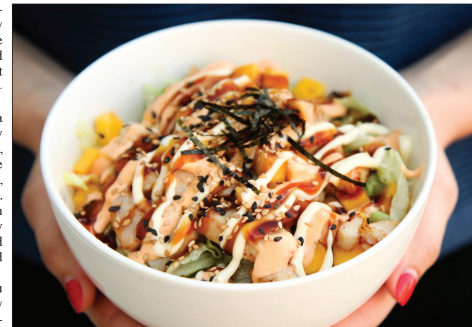
One of the delicious Poke bowls.

I must say that the menu is overwhelming; so many amazing choices. We studied the selections closely and settled on a nice variety. In the temari section, we went for the bomb. Now each temari is prepared with distinctive ingredients, inside and out, giving them a unique character and personality, with spicy light mayo, soy, sesame or yin yang sauce. The bomb has Japanese mayo, teriyaki sauce, sesame and Japanese spices, crab, shrimp, mozzarella, spicy light mayo, Japanese mayo, teriyaki sauce.