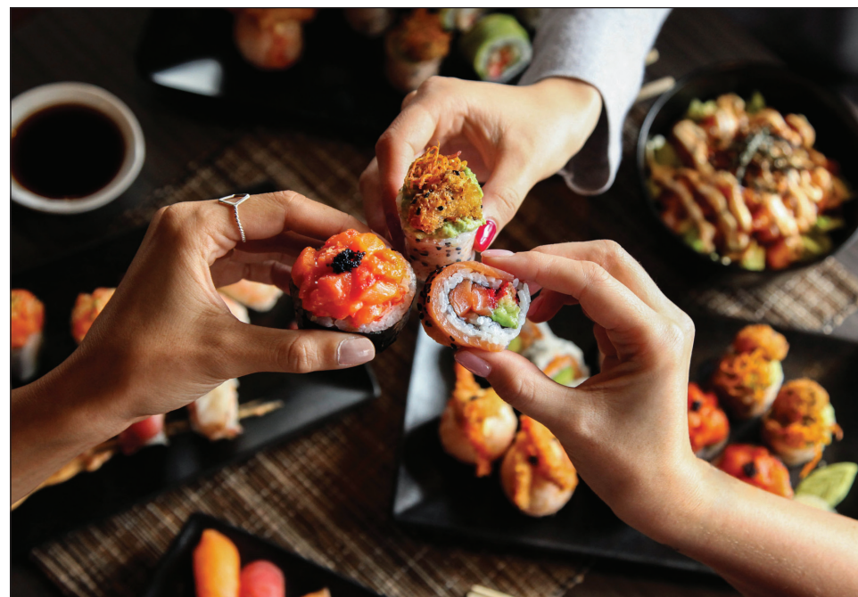
Sushi Shop has an extensive selection on its menus.

For more reviews please go to www.MtlRestoRap.com , a proud partner of The Montrealer.