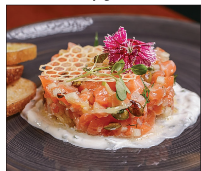
The salmon tartare at COMMODORE

After some glasses of bubbly prosecco, my dining partner and I discovered a menu that is enriched with bold new additions. You can start your dinner with the new lobster bisque cappuccino, an innovative appetizer that combines sophistication and refined flavors. That is what my guest chose for her appetizer. I opted