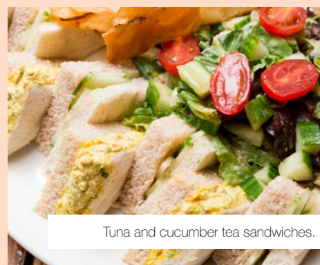
Tuna and cucumber tea sandwiches. |

sandwiches with crisps (i.e. chips) and salad, the Little Burgundy Fish & Chips, Shepherd's Pie, and the Ticky Toffee, cheesecake and the brandy chocolate mousse for dessert.