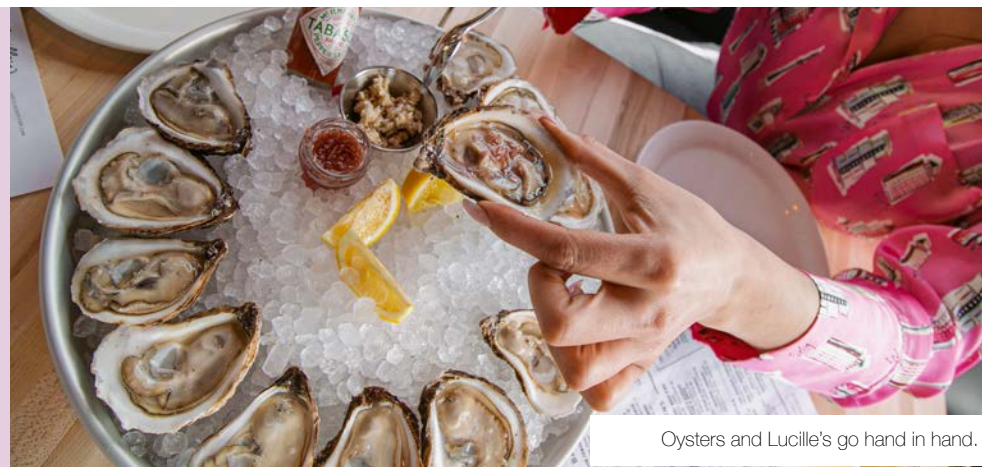
Oysters and Lucille's go hand in hand. |

first Lucille's experience at Fairview. The entrance is fully wheelchair accessible. So is access to the gender-neutral washrooms and the seasonal terrasse. Let us recommend the half seafood tower, containing fresh lobster, snow crab, shrimp and oysters. As well, the Asian-style salmon tartare, the 45-ounce porterhouse steak and for dessert, the domed chocolate mousse cake or key lime pie.