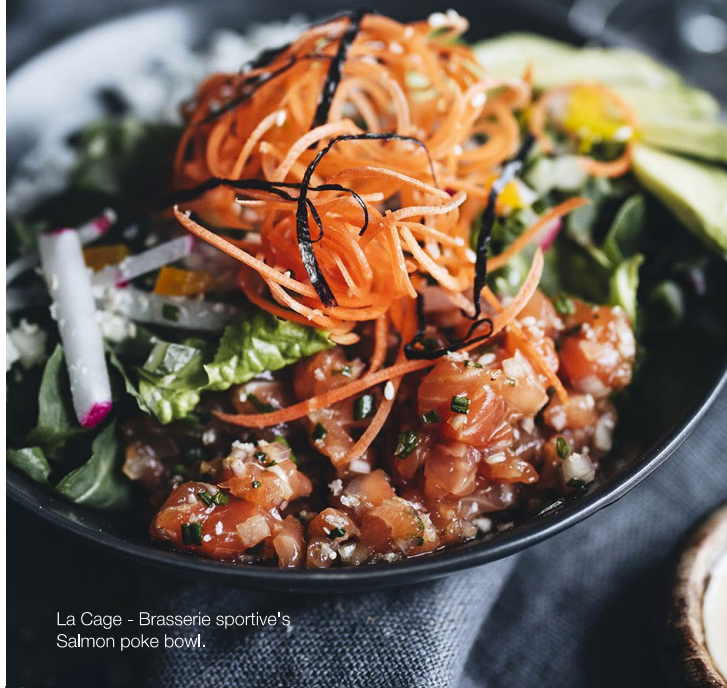
La Cage - Brasserie sportive's Salmon poke bowl.